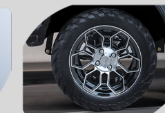
Silent Tire with Off-road Thread