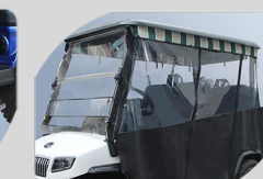
Optional All-Weather Enclosure