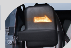
Powered Rear View Mirrors