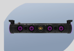
Cylindrical Evolution Sound Bar