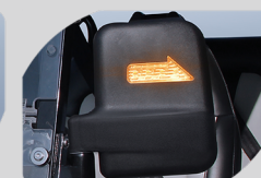
Powered Rear View Mirrors