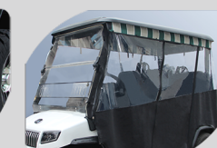
Optional All-Weather Enclosure