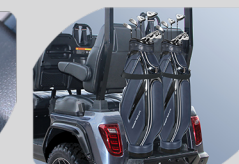
Optional Golf Bag Holder