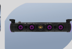
Cylindrical Evolution Sound Bar